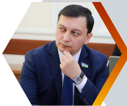
Aslonov Abdullo Ubaydulloevich Deputy Minister of Sports Development of the Republic of Uzbekistan